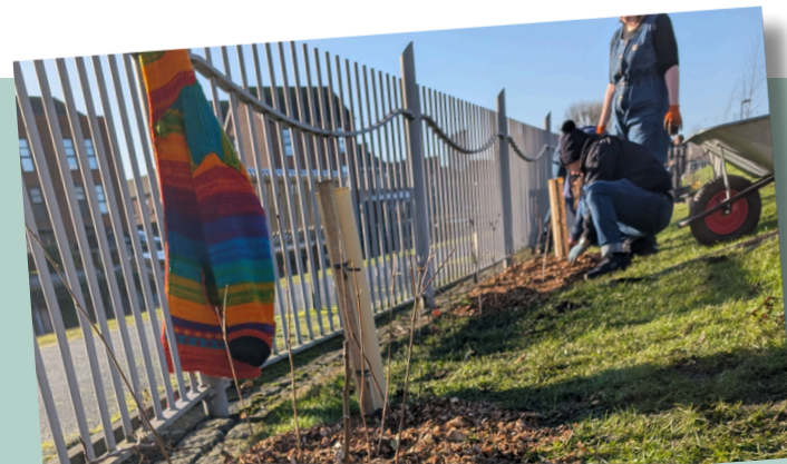
Bryony Carter doing some planting

Contact your Neighbourhood Team by emailing NorthNeighbourhoodTeam@manchester.gov.uk