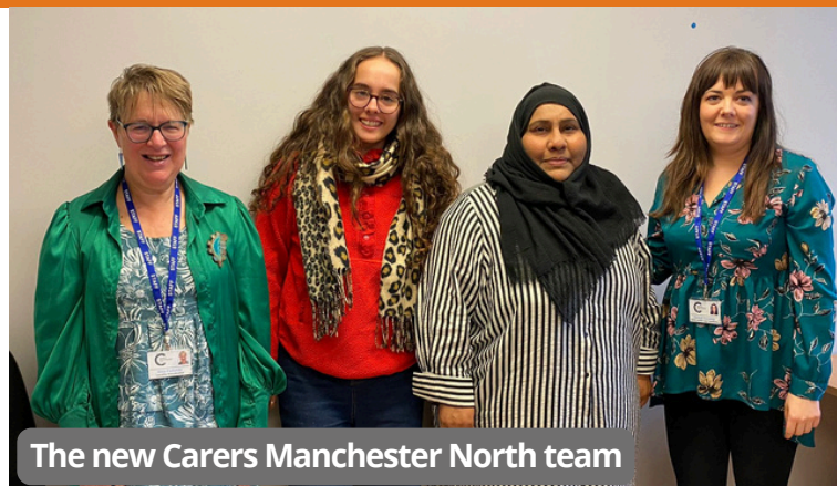
The new Carers Manchester North team

We know from national studies (Carers UK charity) that carers are often lonely and worn out. Meeting fellow unwaged carers at the art gallery or football museum or in a local park could be just the respite you need.