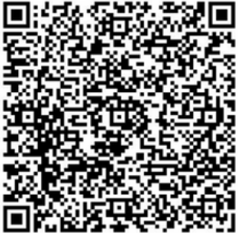
Lunchtime Learning - MONDAY