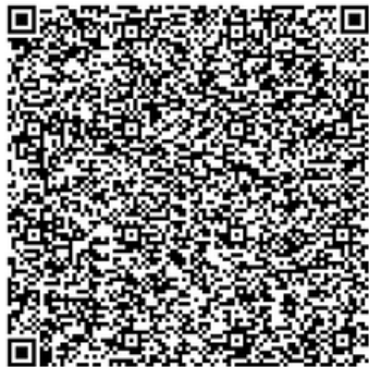
Lunchtime Learning - WEDNESDAY